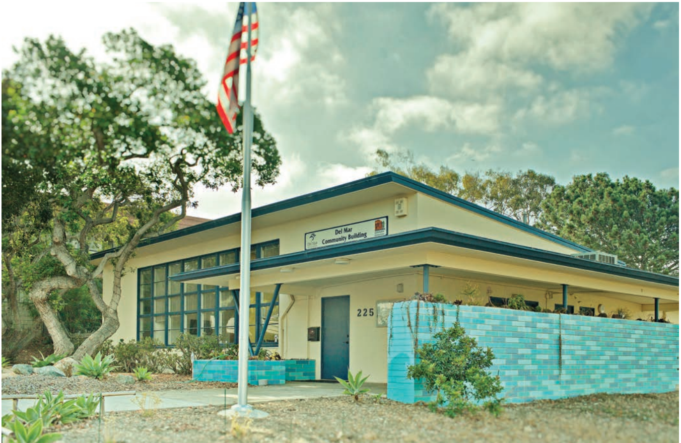
Del Mar Community Building - home of the Del Mar Foundation