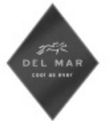
Del Mar Thoroughbred Club