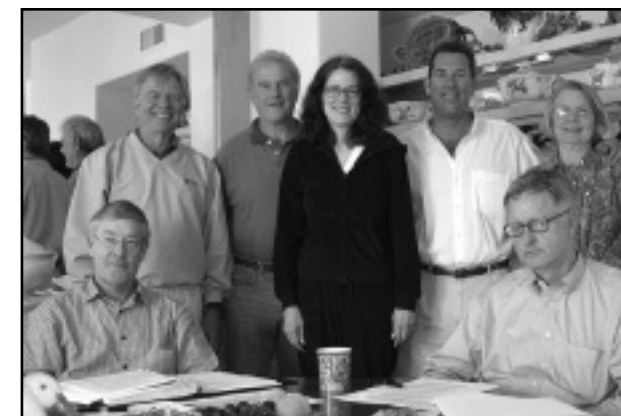
Investment Advisory Committee

The Children's Committee meets the last Wednesday of the month on the balcony of the Powerhouse.