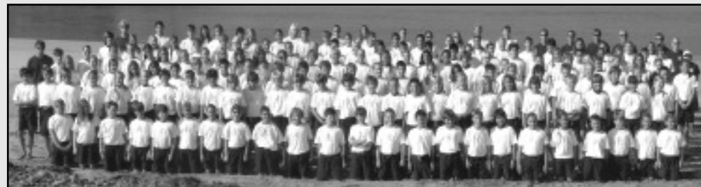
Junior Lifeguard Program

Our Junior Lifeguard program is the best in southern California if not the world. The Del Mar Foundation's $3,000 grant to this program ensures that children, no matter their income level, can partake in this important program.