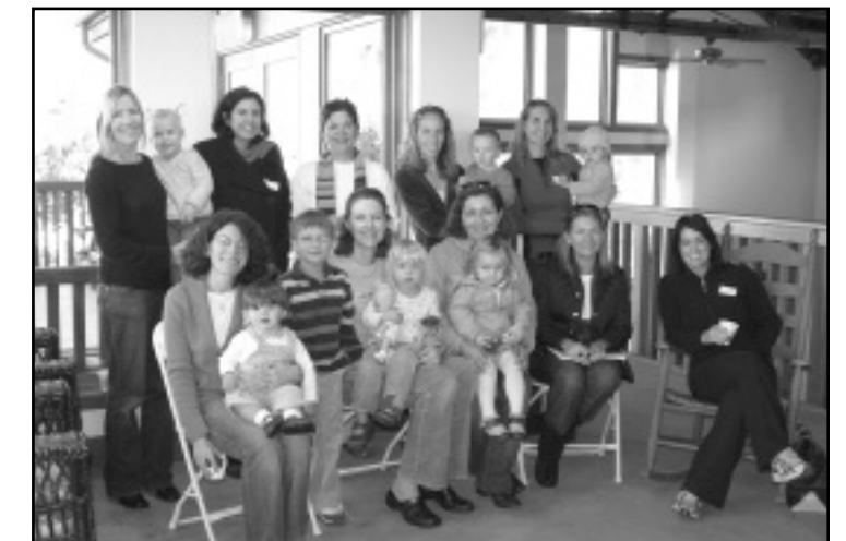
Children's Committee Children@delmarfoundation.org

Our Junior Lifeguard program is the best in southern California if not the world. The Del Mar Foundation's $3,000 grant to this program ensures that children, no matter their income level, can partake in this important program.