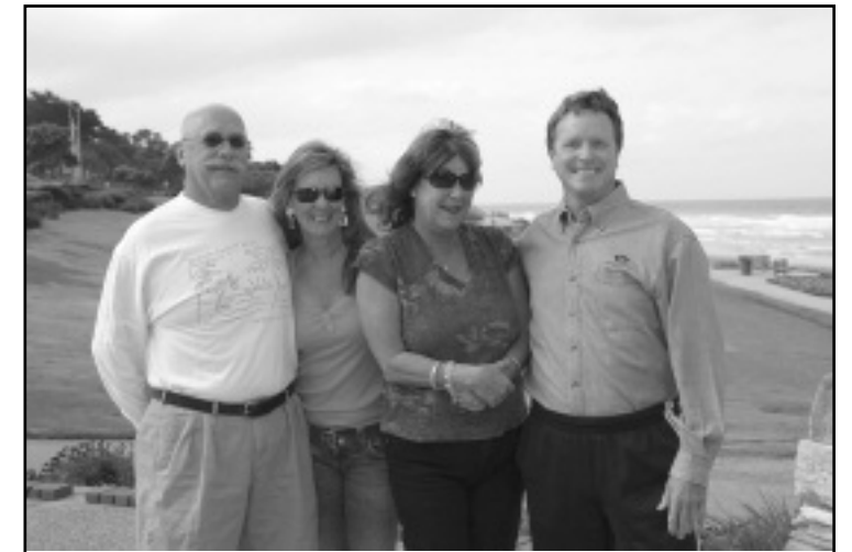
Summer Twilight Concert Committee Info@delmarfoundation.org

Cultural Arts Committee meets the first Wednesday after the First Thursdays event on the balcony of the Powerhouse.