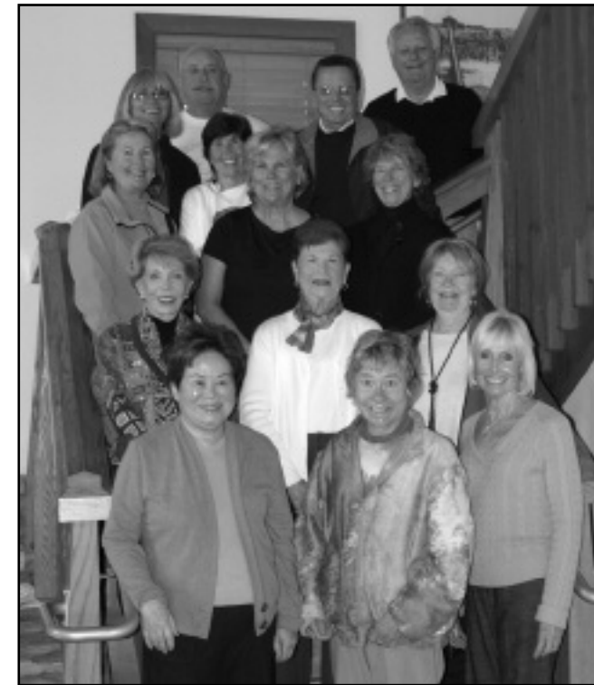
Cultural Arts Committee CA@delmarfoundation.org

Joining one of our committees is the way you can shape what happens in your community. It is so true that our community is what we make it. Would you like to see a Halloween Parade? Or revive the Payasada horses? How about a particular band at the Twilight Concerts? Interested in seeing a night of Gypsy music at First Thursdays? Do come join in and meet wonderful neighbors in the process. We promise you will have a good time doing lots of hard work. The Del Mar Foundation would love your help.