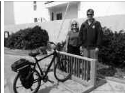
Bike Racks at the Beach