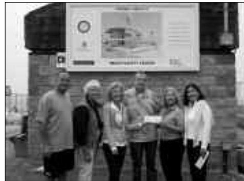
Matching Grant for New Beach Safety Center

Go to www.delmarfoundation.org for application