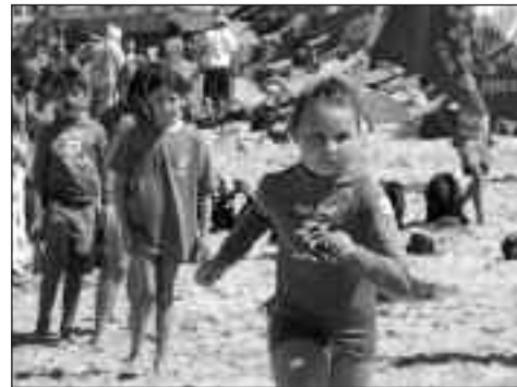
Del Mar Junior Lifeguards Program