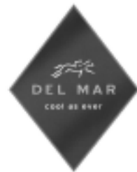
Del Mar Thoroughbred Club